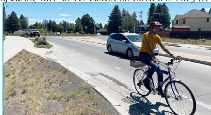
Oregon Friendly Drivers learn about proper use of bike lanes

Oregon Friendly Driver is a course for people who drive that helps to educate on how to safely use the roadway with people who are walking and biking. The Live Webinars, the Online Course, and the in-person class include pre- and post-tests.