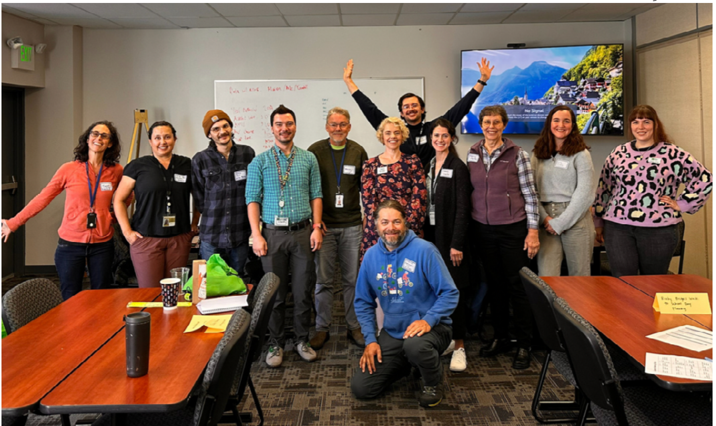
Technical Assistance Program Team

Commute Options provides support to statewide Safe Routes to School efforts as a part of the Technical Assistance Program team. In 2023, 29 Hub meetings brought SRTS implementers together, 10 statewide webinars offered training for SRTS practitioners, 4 quarterly statewide meetings brought the community together and 9 JumpStart bicycle and pedestrian safety education Train-the-Trainer sessions were held across the state. After creating new toolkits for practitioners, we were able to award 150 kits to different programs this year to help grow and strengthen their SRTS Programs. In addition we prepared guides and incentives for Walk+Roll to School Days with event ideas, outreach material in English and Spanish, and tips for making events successful. We continued to lead the Oregon SRTS statewide communication efforts, and help with the design and implementation of bicycle and pedestrian safety courses.