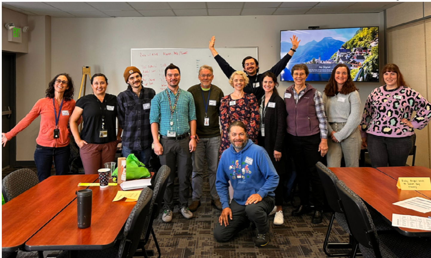
Technical Assistance Program Team

Commute Options provides support to statewide Safe Routes to School efforts as a part of the Technical Assistance Program team. In 2023, 29 Hub meetings brought SRTS implementers together, 10 statewide webinars offered training for SRTS practitioners, 4 quarterly statewide meetings brought the community together and 9 JumpStart bicycle and pedestrian safety education Train-the-Trainer sessions were held across the state. After creating new toolkits for practitioners, we were able to award 150 kits to different programs this year to help grow and strengthen their SRTS Programs. In addition we prepared guides and incentives for Walk+Roll to School Days with event ideas, outreach material in English and Spanish, and tips for making events successful. We continued to lead the Oregon SRTS statewide communication efforts, and help with the design and implementation of bicycle and pedestrian safety courses.