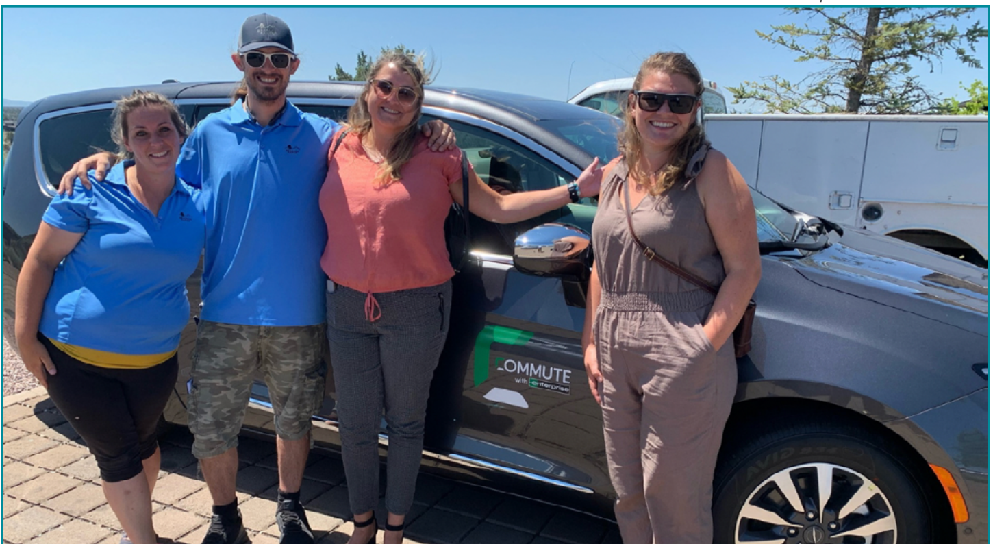
Vanpool for Brasada Ranch

Vanpooling provides a solution for employers to reduce carbon emissions, parking needs and the number of solo drivers on the road. Employees arrive to start their workday in a better state of mind. And the IRS provides tax incentives for employers and employees for vanpooling. All of these benefits make it a win for commuters, employers, communities and the environment!