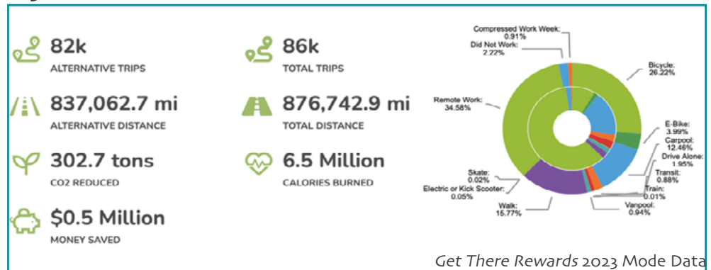
Get There Rewards 2023 Mode Data

We continue to offer a $20 Tango card as the reward once a participant has logged 45 Transportation Options trips. There are hundreds of options with the Get There Rewards choices expanded with the Tango Card, offering a global catalog of the most popular gift cards, prepaid cards, and donations that are sent directly to the recipient's email.