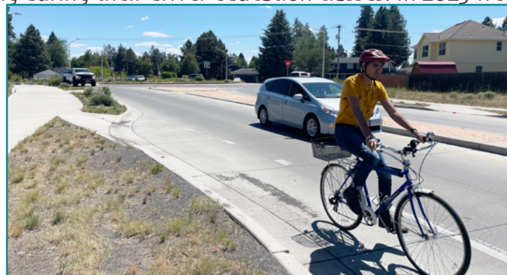
Oregon Friendly Drivers learn about proper use of bike lanes

Oregon Friendly Driver is a course for people who drive that helps to educate on how to safely use the roadway with people who are walking and biking. The Live Webinars, the Online Course, and the in-person class include pre- and post-tests.