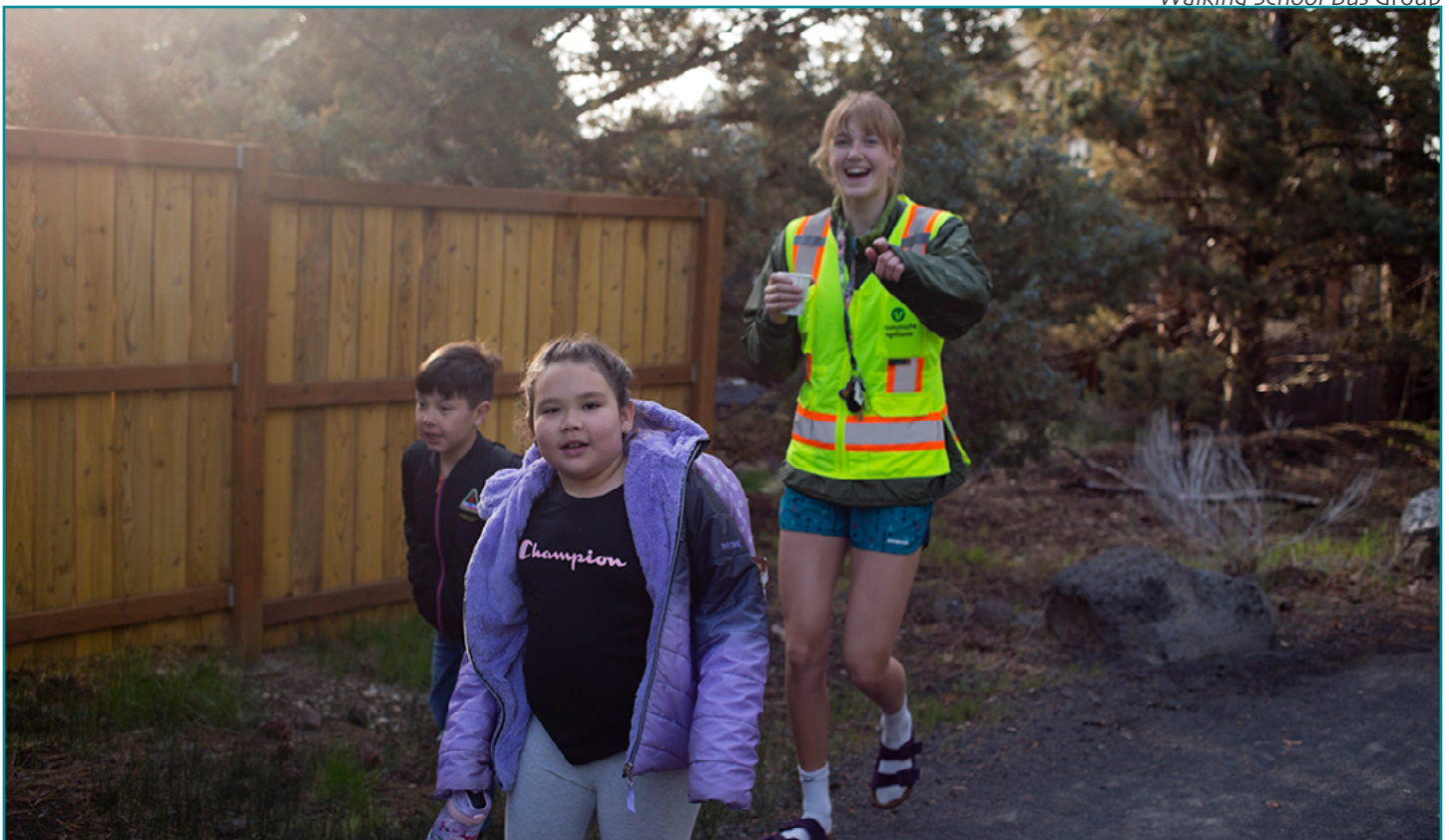
Walking School Bus Group

We expanded the Walking School Bus program by adding more routes during the 2022/2023 school year, more funding, more leaders, and more creative ways to integrate walking and biking safety into the daily journey of each of the Walking School Bus groups. We had 3 active Walking School Bus routes supported by 1 paid leader and 4 volunteer leaders. There continues to be a growing interest in and demand for the Walking School Bus Program. Over time we plan to see the Walking School Bus as very broadly implemented transportation option for all schools