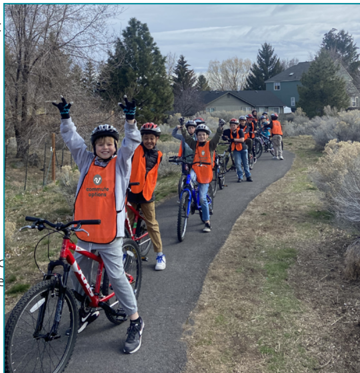
Bike Safety Education

We gathered at Juniper Park to enjoy hot cocoa, donations from a local bakery, and a few words about Ruby Bridges. The group divided to walk to school, some making their way to Juniper Elementary and the rest heading to Bear Creek Elementary. It was a wonderful opportunity for families to connect, learn, and get a few extra steps into their day.