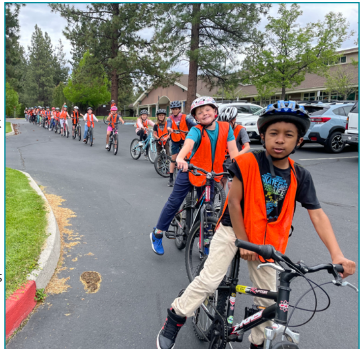
Bike Safety Education

On November 14, 2022, we celebrated Ruby Bridges Walk to School Day. We gathered at Juniper Park to enjoy hot cocoa, a few words about Ruby Bridges, and then a group walk to school. It was a wonderful opportunity for families to connect, learn, and get a few extra steps into their day.