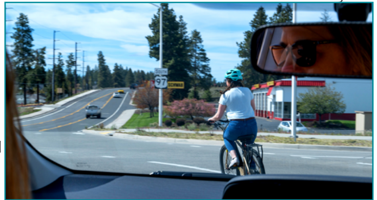
Oregon Friendly Drivers learn to use a roundabout with people on bikes

Last year 378 participants successfully completed the class, received an Oregon Friendly Driver Certificate, and became a more friendly driver on our roadways.