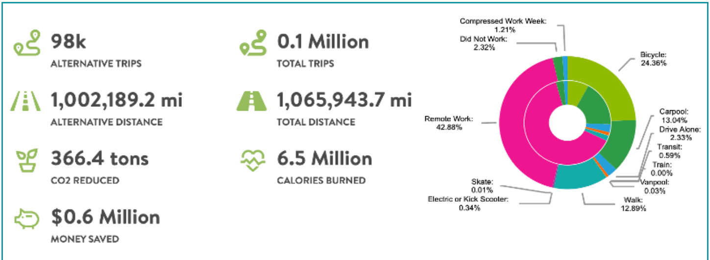
Get There Rewards 2022 Mode Data

Sponsored by the Oregon Department of Transportation (ODOT) Get There Connect and its partners across the state, helps commuters and employers shift business practices and work habits one trip at a time. Commute Options' Get There Rewards program changes personal travel behavior, improving health, saving money, and reducing parking needs. Incentives come to employees through the Get There Rewards program, which encourages use of walking, biking, carpooling, vanpooling, remote work and compressed work week instead of driving alone. In 2022, 651 New Users registered in Get There bringing the total users to over 3,000. We distributed over 800 rewards for using the Get There Rewards network for the 97,702 trips logged! These trips alone saved 995,758 miles of driving on our roads and reduced carbon emissions by 341,542,058 CO 2 grams.