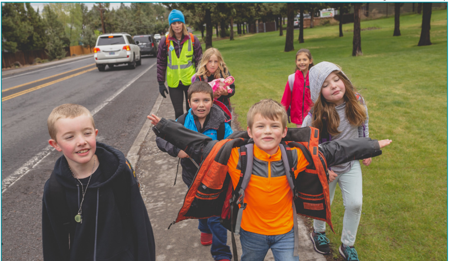
Walking School Bus Group

We expanded the Walking School Bus program in the Fall of 2022 by adding more routes, funding, leaders, and creative ways to integrate walking and biking safety into the daily journey of each of the Walking School Bus groups. We had 3 active Walking School Bus routes supported by 2 paid leaders and 4 volunteer leaders. There continues to be a growing interest in and demand for the Walking School Bus Program. Over time we plan to see the Walking School Bus as very broadly implemented transportation option for all schools.