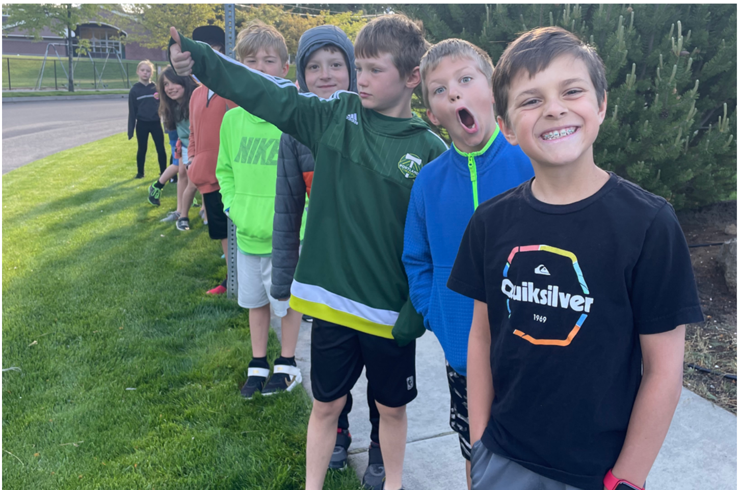
Pedestrian Safety Education

Commute Options provides support to statewide Safe Routes to School efforts as a part of the Technical Assistance Program team. In 2022, we hosted 12 webinars and statewide meetings, and led 11 regional meetings for SRTS practitioners in Central, Eastern and Southern Oregon. We created a toolkit specifically for SRTS practitioners in rural Oregon to help maximize their SRTS activities. In addition to this toolkit, we prepared guides for Walk+Roll to School Days with event ideas, outreach material in English and Spanish, and tips for making events successful. We continued to lead the Oregon SRTS statewide communication efforts, and help with the design and implementation of bicycle and pedestrian safety courses.